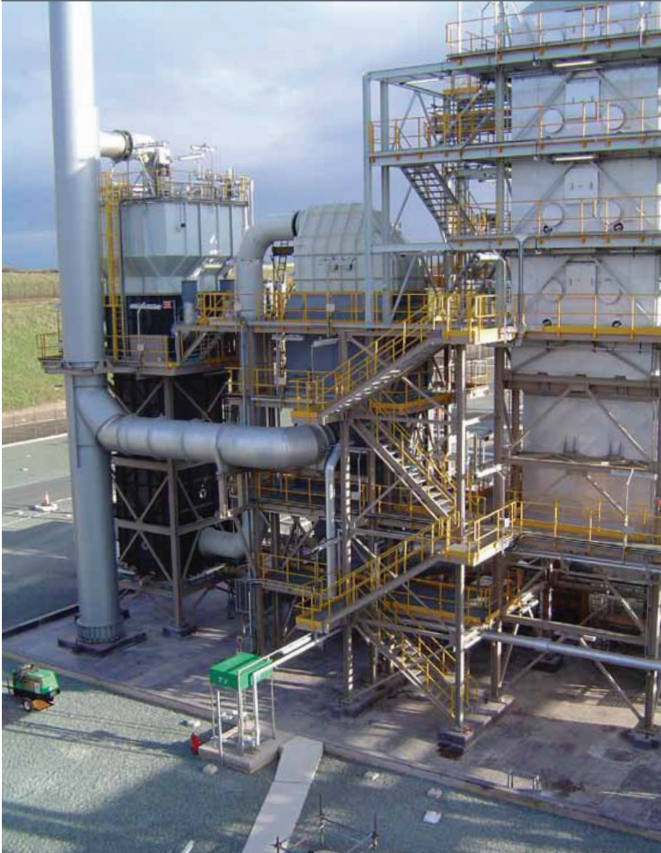
SULFOX ™ HK