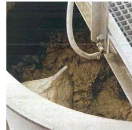
DYNAWAVE® EFFLUENT BLEED TANK